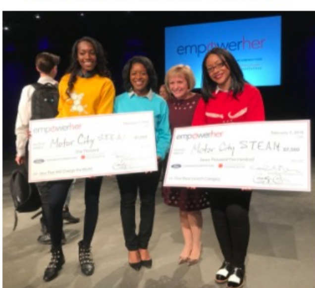
Detroit-based Motor City STEAM won $21,000 worth of prizes at the EmpowerHER Social Enterprise Pitch Competition Wednesday in Dearborn.

Detroit-based Motor City STEAM LLC won the launch category, which includes $7,500 in prizes and an optional $5,000 investment, and the audience vote worth $1,000.