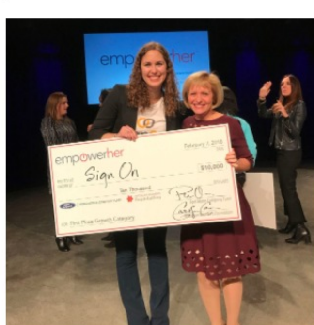
Grosse Pointe Farms-based SignOn won the biggest prizes worth $25,000 at the EmpowerHER Social Enterprise Pitch Competition Wednesday in Dearborn.

SignOn was the big winner in the inaugural Ford EmpowerHER Social Enterprise Pitch Competition Wednesday taking home $10,000 in prizes and an optional $15,000 investment.