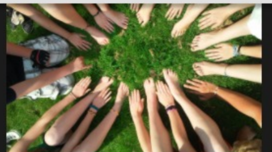
Building Healthy and Drug-Free Communities