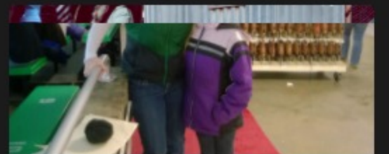
Changing Lives with Mentoring